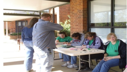
Rabies Volunteers and Clients